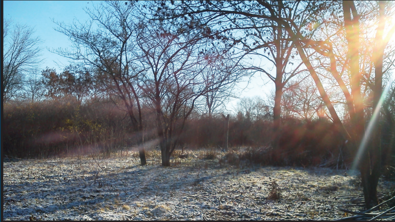
A frosty fall morning in a recently cut-over area of the Humbug Marsh Unit intended to set-back shrub succession by mimicking a moderately-sized windthrow event, which will benefit species like northern flicker, migrant rusty blackbirds, and migrant American woodcocks that share similar habitat requirements with hundreds of other species, including neotropical migrant songbirds.

We are all familiar with prioritizing our activities based on finite time and money. Refuge habitat management is the same, with a truly infinite continuum of ecological health to be achieved, yet limitations of time and resources. It is for this reason that priorities must be set.