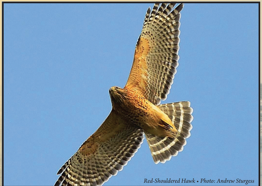
Red-Shouldered Hawk

After an underwhelming 2012, the 2013 hawk watch season was far more lively, much to the delight of our many dedicated volunteers and interested visitors. This fall, we shattered the previous season high count for Bald Eagles, eclipsing the 350 individuals observed plateau for the first time ever. Turkey Vultures were seen in their second highest overall number in the count's history. Rough-legged Hawks turned in their best showing since 2004. And all three regularly occurring falcon species (American Kestrel, Merlin, and Peregrine) sped by in their highest numbers since 2007. All in all, it was quite the turnaround from 2012, when the only species to be seen in above average numbers was Bald Eagle. Here's one hawk watcher hoping 2014 is equally as enjoyable.