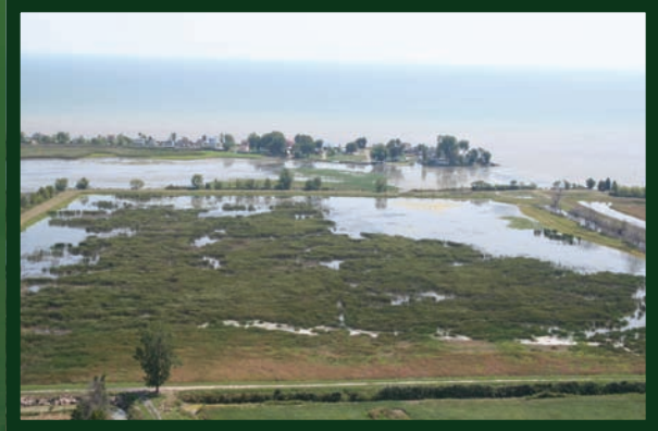
Brancheau Unit as it appeared in late summer 2012 (opened to a managed hunt) at the Pointe Mouillee State Game Area. Conditions should be similar in 2013 with some reduction in narrow-leaved cattail.

View the Hunt brochure at http://www.fws.gov/refuge/Detroit_River/visit/visitor_activities.html