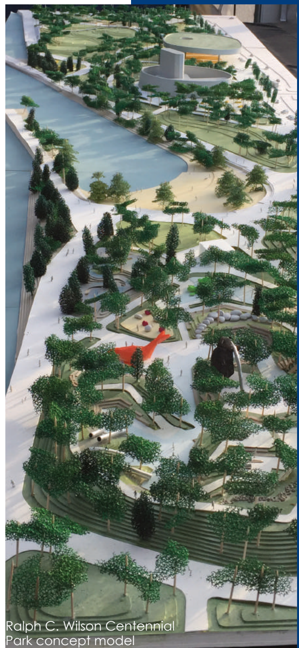
Ralph C. Wilson Centennial Park concept model