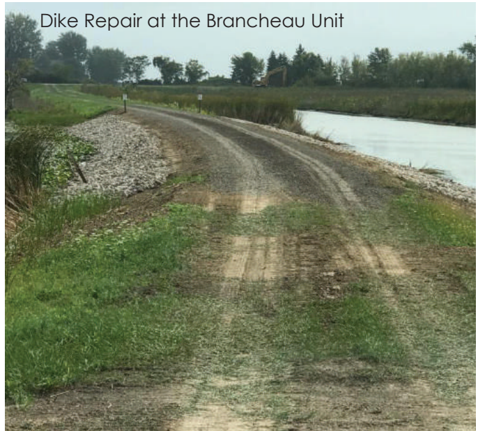
Dike Repair at the Brancheau Unit