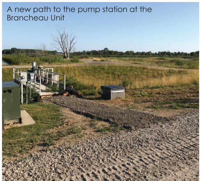
A new path to the pump station at the Brancheau Unit