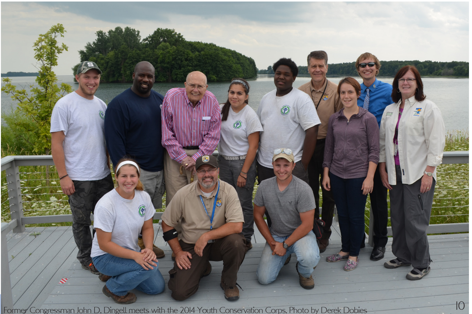
Former Congressman John D. Dingell meets with the 2014 Youth Conservation Corps.

The institutional framework for the refuge continued to mature and expand, reflecting conservation needs and partnership opportunities to build capacity. On the U.S. side, leadership is provided by the USFWS, under the auspices of the National Wildlife Refuge System. Cooperative management agreements are entered into with industries and other organizations to manage lands for conservation purposes. A Memorandum of Understanding has been signed between the USFWS and the Michigan Department of Natural Resources to guide cooperative conservation within the U.S. portion of the Detroit River and western Lake Erie. The International Wildlife Refuge Alliance works with the refuge staff to build capacity, using a series of committees and special teams. The State of the Strait Steering Committee is binational in scope and make-up, whereas the Detroit River Hawk Watch Advisory Committee, Grosse Ile Nature and Land Conservancy, and the Cooperative Weed Management Area are focused just on U.S. initiatives. On the Canadian side, partners work through the Western Lake Erie Watersheds Priority Natural Area. USFWS and Essex Region Conservation Authority have signed a Memorandum of Understanding to work collaboratively on transboundary conservation and outdoor recreational initiatives. Clearly, this institutional framework and transboundary cooperation will continue to evolve and improve consistent with an adaptive management philosophy.