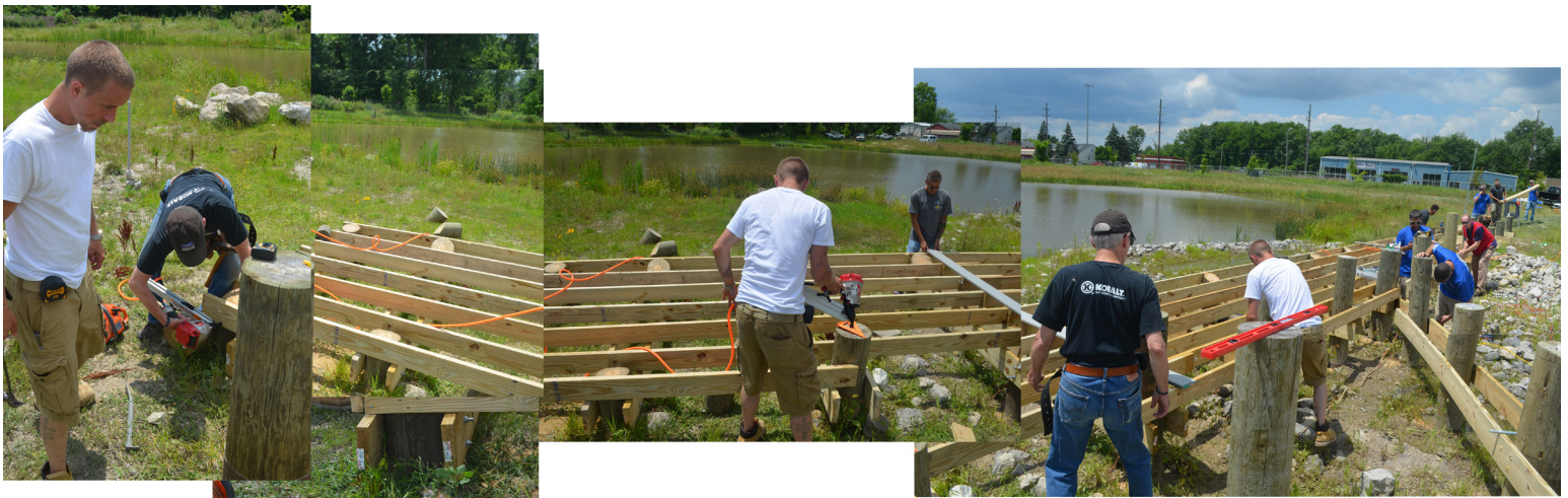
Volunteers from local Lowe's stores build boardwalks reaching between the two cells of the Monguagon Wetland complex.