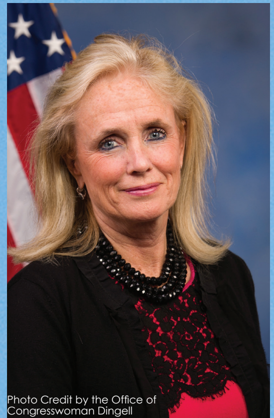
Photo Credit by the Office of Congresswoman Dingell