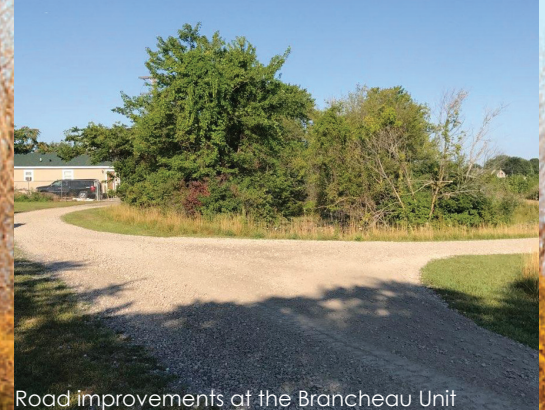
Road improvements at the Brancheau Unit