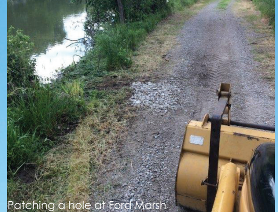
Patching a hole at Ford Marsh