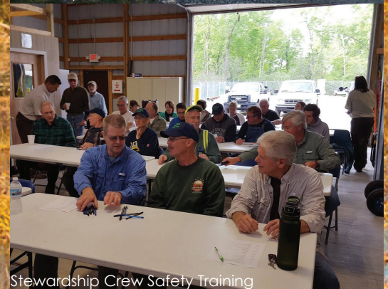
Stewardship Crew Safety Training