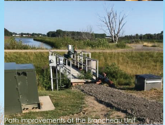
Path improvements at the Brancheau Unit