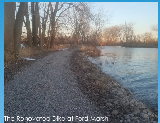
The Renovated Dike at Ford Marsh